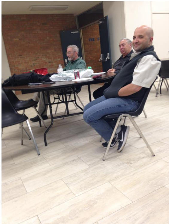
KD5FEE, KC4LUY, KE5PQJ