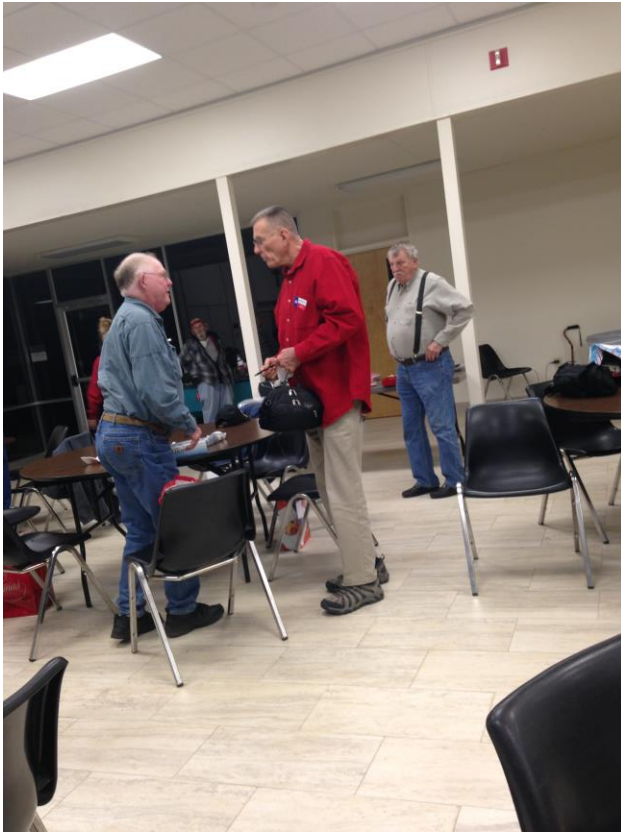
WD5HFD, WA5GVQ, WK5F