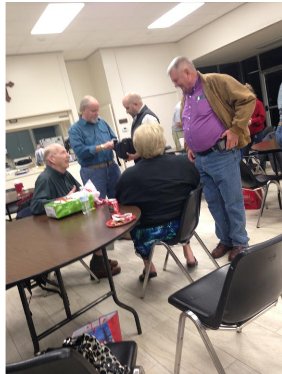
W5TV, W5COX, KE5PQJ, W5TV xyl, KD5GEN