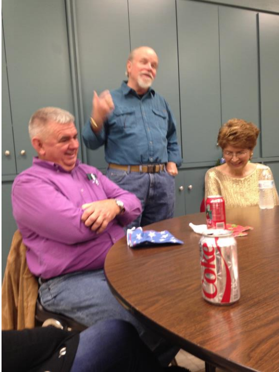
KD5GEN, W5COX, WD5RAH xyl