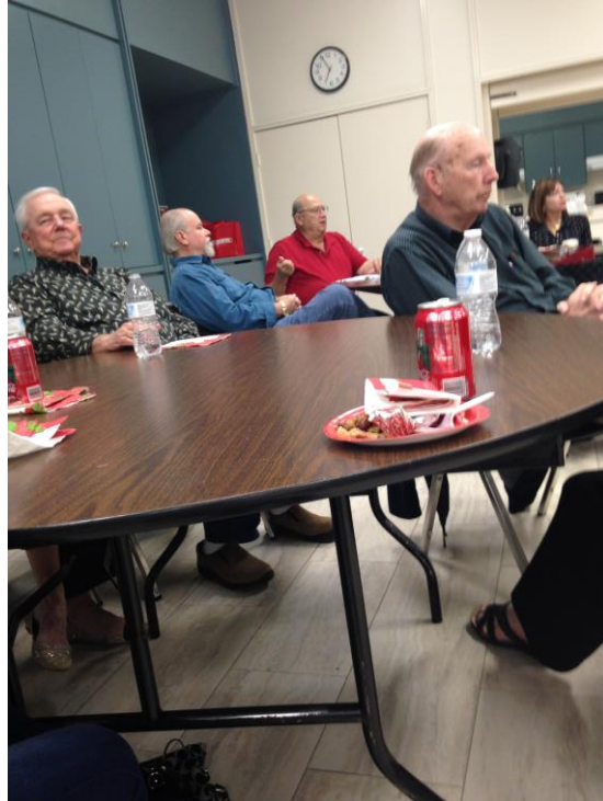
WD5RAH, W5COX, AE5P, W5TV, W5COX xyl